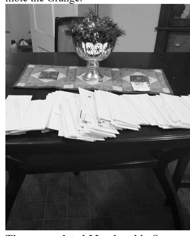
These completed Membership Surveys have arrived in the mail and are ready for tabulating. Is yours among them?

Thank you all for all you do to promote the Grange.