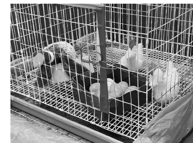
Detail from Grange Booth at Farm & Forest

The Eastern States Exposition (Big E) is scheduled for September 16 to October 2 in West Springfield, MA